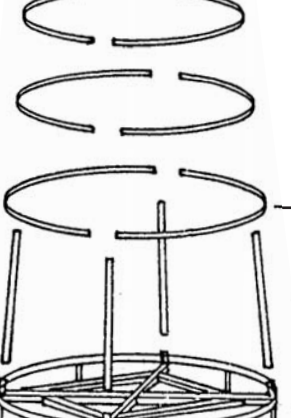
Tree Base Platform

Frame Display comes complete in two boxes. The required tools to assemble the display are a large, rubber mallet and a 9/16" deep-socket wrench. It is recommended to have a number of these tools available. The suggested number of personnel to assemble the tree frame is four. It is strongly recommended to lay out all the component pieces to match like items before assembly.