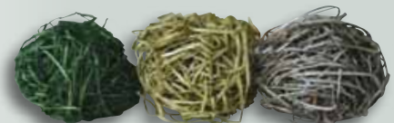
Forest Green (01) Sage (02) Natural (03)

* This product is intended for use in interior applications where combustion-modified chemicals applied to the fibers are not subject to removal by rain or other exposure. Only use I-SME-FR and I-SME-FR5 for base coverage of artificial foliage. Do not use I-SME-FR and I-SME-FR5 in live plant arrangements where watering will cause the product to lose its combustion-modified properties.